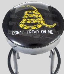
Don't Tread on Me Stools