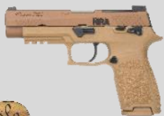
Sig Sauer P320 M17 9mm

"We the People" Guitar personally autographed by Ted Nugent