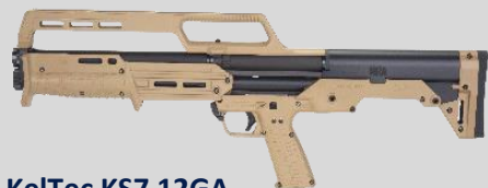
KelTec KS7 12GA