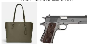
Coach Purse/Wallet Springfield 1911 – Defense Series