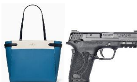
Kate Spade Purse/Wallet M&P Shield EZ 9mm