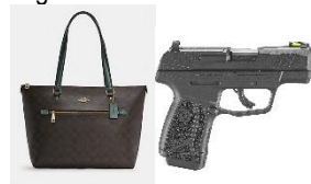
Coach Bag/Wallet Ruger MAX-9 9mm