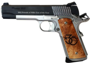
SIG SAUER 1911 STX .45 WITH 30 TH ANNIVERSARY Friends of NRA GRIPS