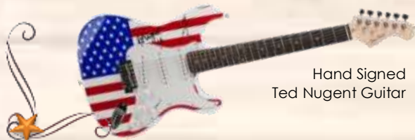
Hand Signed Ted Nugent Guitar