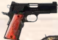
Kimber Pro Carry II .45ACP Rosewood NRA Logo Grips Crimson Trace Laser