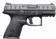
BERETTA APX COMPACT 9 MM