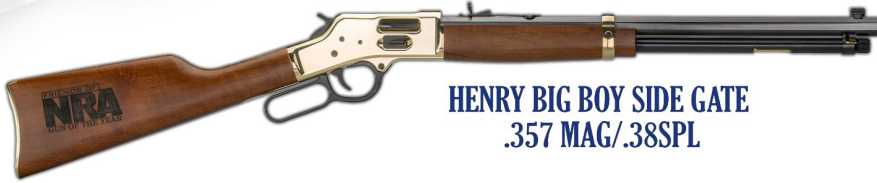
HENRY BIG BOY SIDE GATE .357 MAG/.38SPL