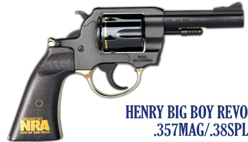
HENRY BIG BOY REVOLVER .357MAG/.38SPL