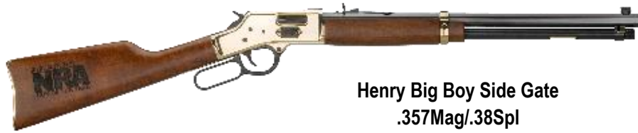
Henry Big Boy Side Gate .357Mag/.38Spl

SIG SAUER P322 with ROMEO Zero Elite .22LR with NRA Seal *