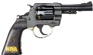
Henry Big Boy Revolver .357Mag/.38Spl