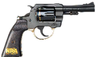
Henry Big Boy Revolver .357Mag/.38Spl

Weatherby Vanguard Compact Hunter .308 WIN with NRA Logo