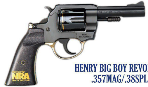
HENRY BIG BOY REVOLVER .357MAG/.38SPL