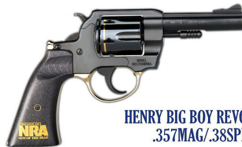
HENRY BIG BOY REVOLVER .357MAG/.38SPL