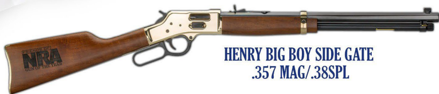
HENRY BIG BOY SIDE GATE .357 MAG/.38SPL