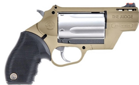
TAURUS PUBLIC DEFENDER 45COLT/410GA