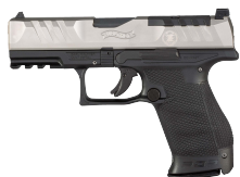
Walther PDP 9MM