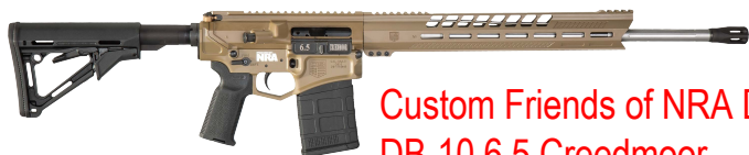
Custom Friends of NRA Diamond Back DB-10 6.5 Creedmoor