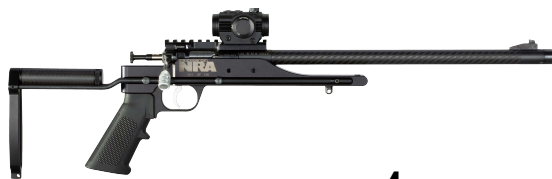
Keystone Over-lander .22 Mag