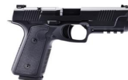
DANIEL DEFENSE H9