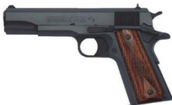
Colt Government 1991 Series

Reserved Table of 8 – 8 Dinner Tickets for Event