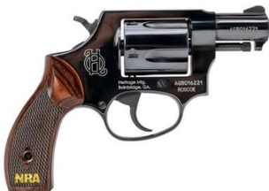
HERITAGE ROSCOE 38SPL W/NRA GRIPS