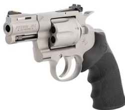
COLT PYTHON .357 MAG 3"