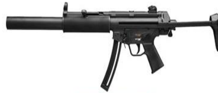
HECKLER & KOCH MP5 CALIBER: .22 LR