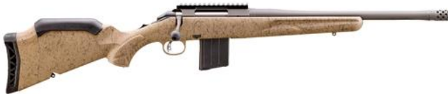
RUGER AMERICAN RANCH RIFLE GEN II 400 LEG CALIBER: 400 LEGEND