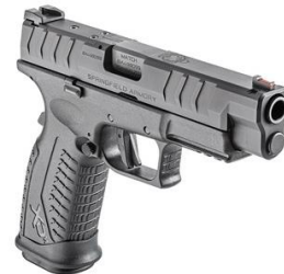
SPRINGFIELD ARMORY XDM ELITE 4.5" OSP 10MM CALIBER: 10MM