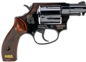
HERITAGE ROSCOE 38SPL W/NRA GRIPS