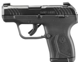
RUGER LCP MAX .380