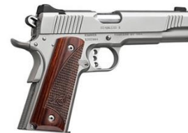
KIMBER STAINLESS II .45ACP