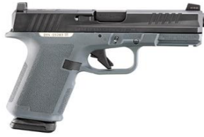
RUGER RXM 9MM CALIBER: 9MM

Reserved Table of 8 – 8 Dinner Tickets for Event