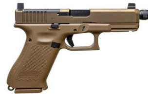
GLOCK 19X MOS 9MM THREADED BARREL