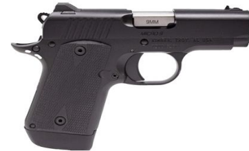
KIMBER MICRO 9 LIBERTY 9MM CALIBER: 9MM