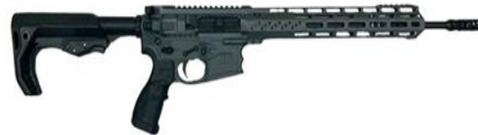
FOSTECH STEALTH SERIES LIGHTNING MODEL 5.56 WITH LOGO