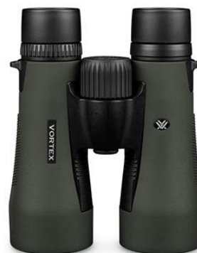
Vortex Diamondback 10x50 HD