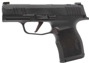
SIG SAUER 365X 9MM CALIBER: 9MM