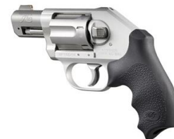
KIMBER K6XS .38 SPL CALIBER: .38 SPL