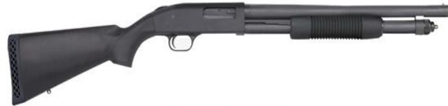
MOSSBERG 590 7-SHOT CALIBER: 12 GA