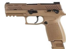
SIG SAUER P320 M18 9MM -COYOTE CALIBER: 9MM