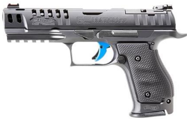
WALTHER ARMS PPQ M2 Q5 MATCH SF 9MM

Reserved Table of 8 – 8 Dinner Tickets for Event