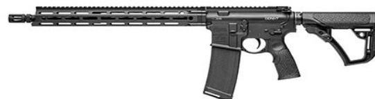
DANIEL DEFENSE DDM4V7