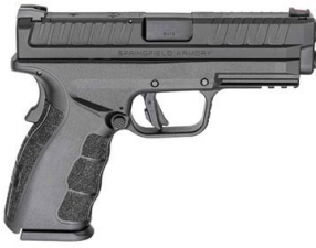
SPRINGFIELD XD MOD.3 9MM

Reserved Table of 8 – 8 Dinner Tickets for Event