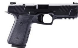
DANIEL DEFENSE H9