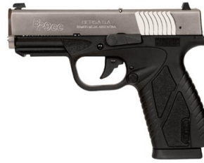
BERSA BP9 9MM - BLACK GRIP/NICKEL SLIDE