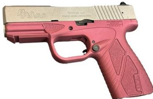
BERSA BP9 9MM - CRANBERRY FROST GRIP/NICKEL SLIDE