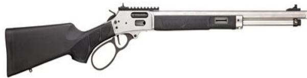
SMITH & WESSON MODEL 1854 .44 MAG