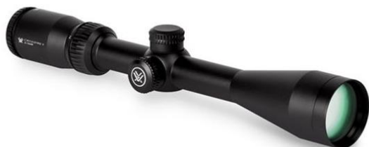
Vortex Crossfire II 4-12x44 HD