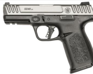
S&W SD40 2.0 2-TONE .40 S&W