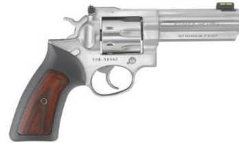
RUGER GP100 357MAG