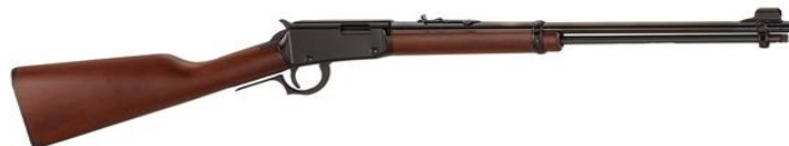
HENRY LEVER ACTION