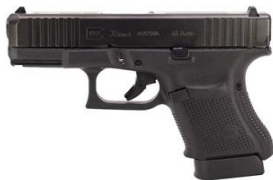
GLOCK 30 GEN5 .45ACP CALIBER: .45ACP