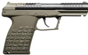
KEL-TEC PR57 GREEN 5.7 X 28MM CALIBER: 28MM