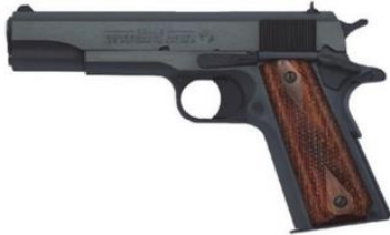
Colt Government 1991 Series

Reserved Table of 8 – 8 Dinner Tickets for Event