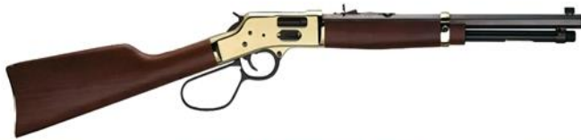
HENRY SIDE GATE CARBINE 45 COLT