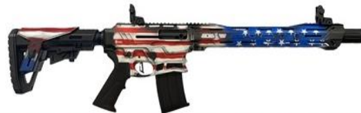
LEGACY SPORTS INTERNATIONAL CITADEL BOSS-25 AMERICAN FLAG 12 GA