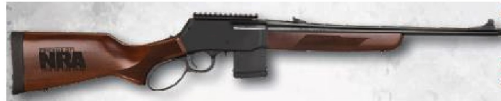
2025 FNRA Gun of the Year