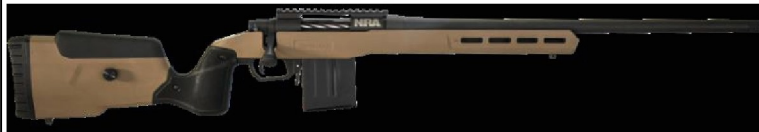
Mossberg Patriot LR Tactical .308 Win With NRA Logo