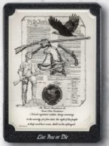
"Live Free or Die" Plaque

Dinner Includes Appetizer, Salad, Beef, Chicken, and Fish main dishes Pasta, Vegetables, and Cookies