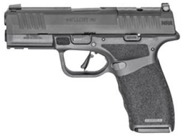
SPRINGFIELD ARMORY HELLCAT PRO 9MM WITH NRA LOGO