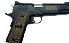
KIMBER CUSTOM II .45ACP WITH NRA LOGO/SERIALIZATION