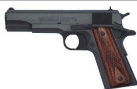
Colt Government 1991 Series

Reserved Table of 8 – 8 Dinner Tickets for Event