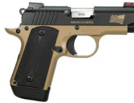
KIMBER MICRO 9 HERO DESERT TAN/BLACK