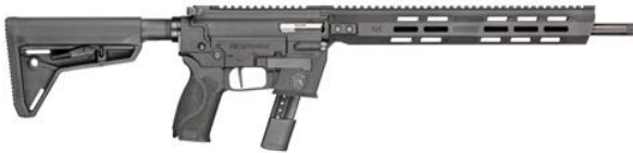
SMITH & WESSON RESPONSE 9MM