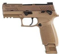
SIG SAUER P320 M18 9MM -COYOTE