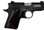
KIMBER MICRO 9 WITH NRA LOGO/SERIALIZATION