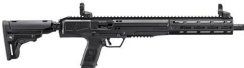
RUGER LC CARBINE 45 ACP