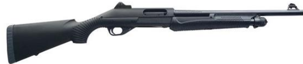
BENELLI NOVA TACTICAL SHOTGUN