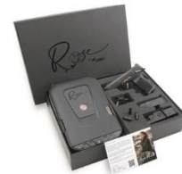
SIG SAUER P365-380 ROSE