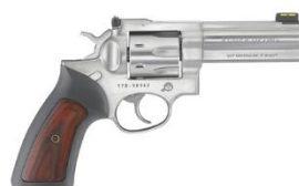
RUGER GP100 357MAG