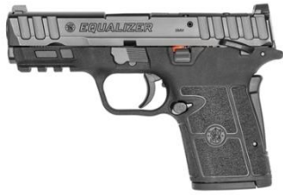
SMITH & WESSON EQUALIZER 9MM

Reserved Table of 8 – 8 Dinner Tickets for Event