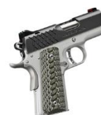
KIMBER AEGIS ELITE ULTRA