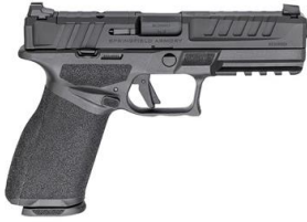
SPRINGFIELD ECHELON 9MM

Reserved Table of 8 – 8 Dinner Tickets for Event