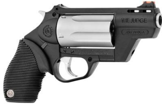
TAURUS JUDGE PUBLIC DEFENDER .45 LC/.410GA