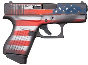
GLOCK 43 9MM DISTRESSED FLAG