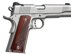
KIMBER STAINLESS II .45ACP CALIBER: .45ACP