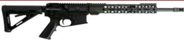
Ohio Made ACME Machine AR-15 Choose Caliber! .556 NATO, .22LR, 300 Blackout , 350 Legend or 6.5 Grendel!