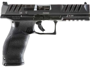
Walther PDP C 4'' 9mm

Drawing to be held on or before May 16, 2025