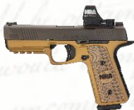
Daniel Defense H9 9mm with Vortex Red Dot Friends of NRA Edition