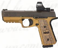
Daniel Defense H9 9mm with Vortex Red Dot Friends of NRA Edition