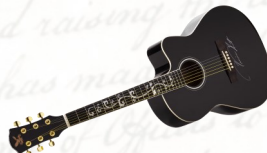
Guitar Signed by Travis Tritt