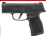
SIG SAUER 385X 9MM

Ohio Made ACME Machine AR-15 Choose Caliber! .556 NATO, .22LR, 300 Blackout, 350 Legend, 6.5 Grendel