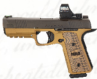
Daniel Defense H9 9mm with Vortex Red Dot Friends of NRA Edition