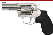
COLT KING COBRA CARRY .357 MAG

Firearm Choices subject to change - Ask for full list of options