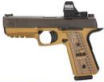
2026 Gun of the Year